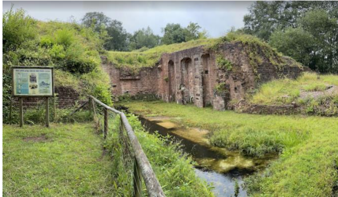
Remains of the Nynehead boat lift

Then through the grounds of the rather splendid Nynehead Court, now a seemingly luxurious home for the elderly. Crossing the fields of the Nynehead estate, we returned to the canal and retraced our steps to the cars. Debrief was held in the adjacent coffee bar or, for those with a more substantial thirst, in the Globe Inn at Sampford Peveril.