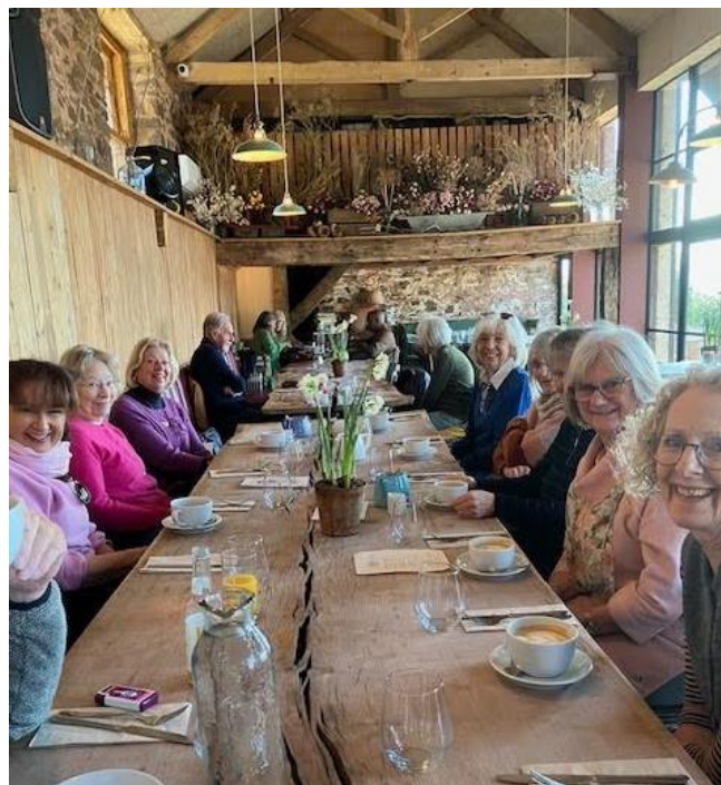
Group brunch at the Lost Kitchen

Sixteen members enjoyed brunch at The Lost Kitchen before attending our first garden visit of 2026 - to Knightshayes. The garden, as always, with its tapestry of spring flowers did not disappoint and was radiant in the beautiful bright sunshine. Margaret