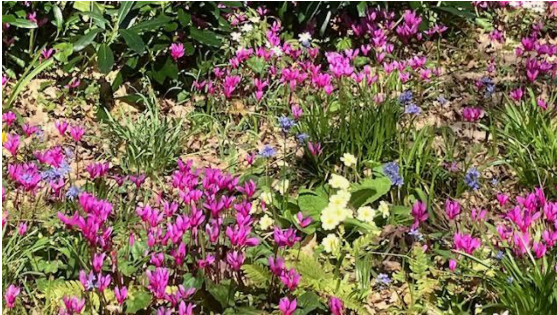
Spring flowers at Knightshayes