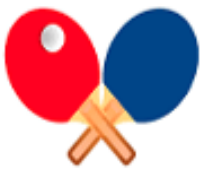
Table Tennis Coordinators: Katherine Green Lorne Loxterkamp

Good moorland views if weather is kind. Walk is 7.5 miles, 10 am start with picnic lunch.