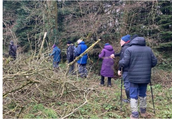
Battling through the fallen tree

maintained by a local farmer, crossing two fields and then following a track. I had discovered on the recce that a huge tree had fallen, completely covering the path but had managed to break off sufficient small branches to enable us to clamber over it. Despite the traffic noise from the road and the occasional passing train, the fields and the little River Lynher gave the impression of calm countryside. Via a rather artistically decorated tunnel, a carpark and a track we made our way back to the canal and thence the cars. No Mud! - Jenny.